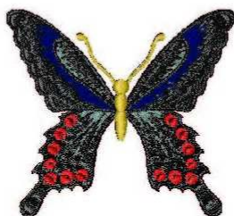
F02 Butterfly 2