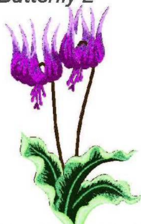
F05 Dog Tooth Violet