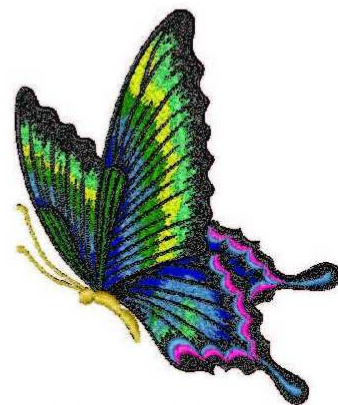
F03 Butterfly 3