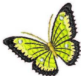
F01 Butterfly 1