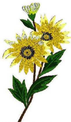
F04 African Daisy